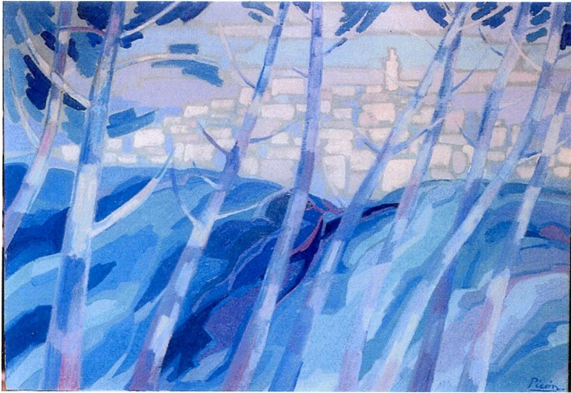
H/T 1985 92/65